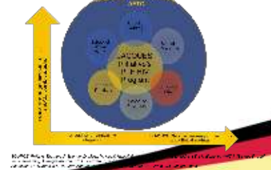
Figure 1: Preparing the Future (PTF) HIV Educational Program Model