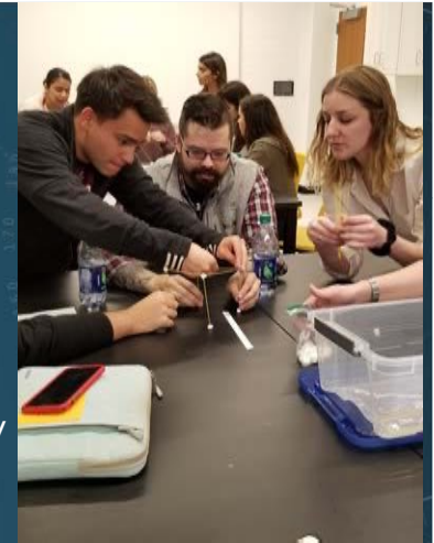
[2019] Team Red Hawk Spaghetti Tower IPE Event